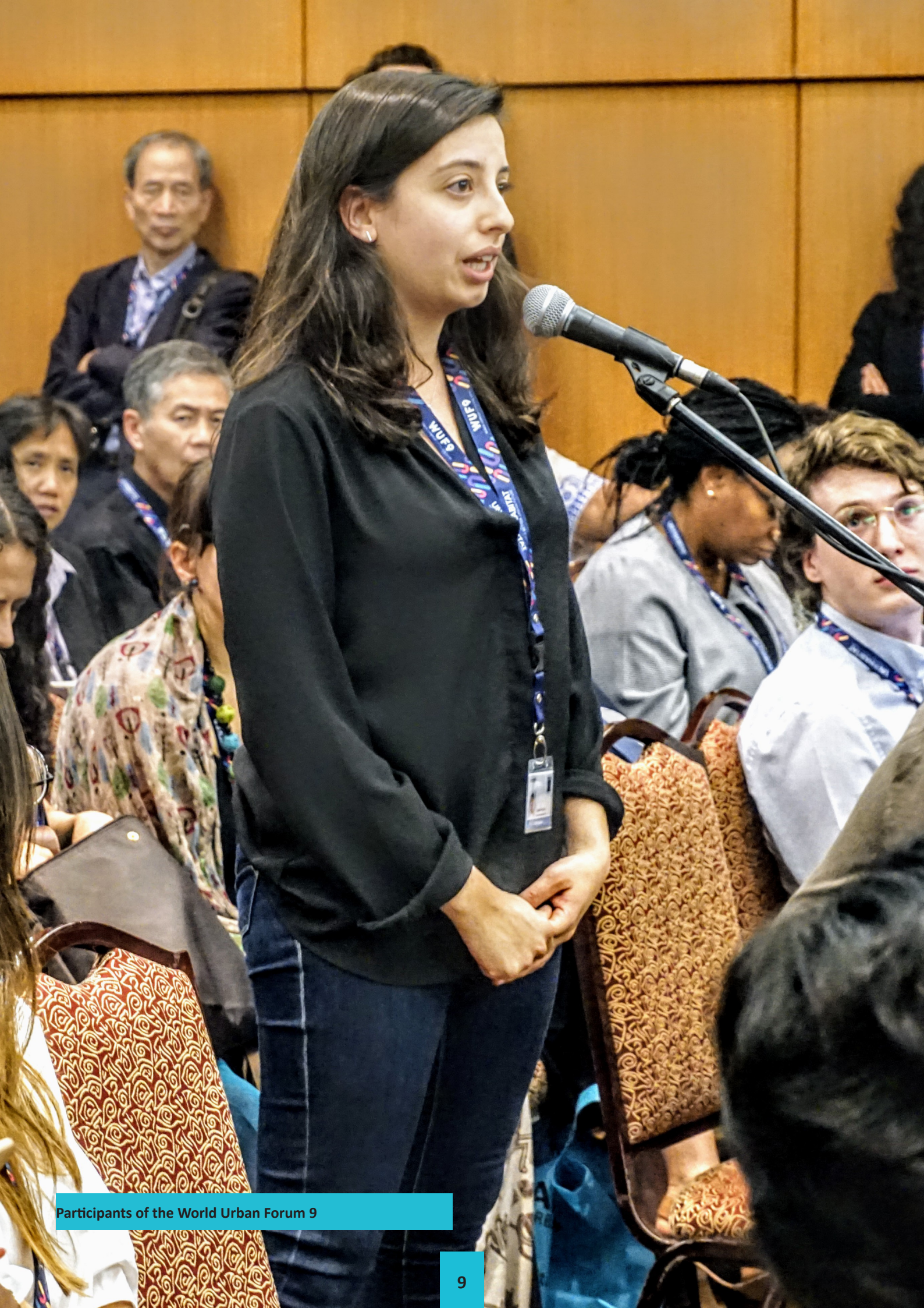
Participants of the World Urban Forum 9