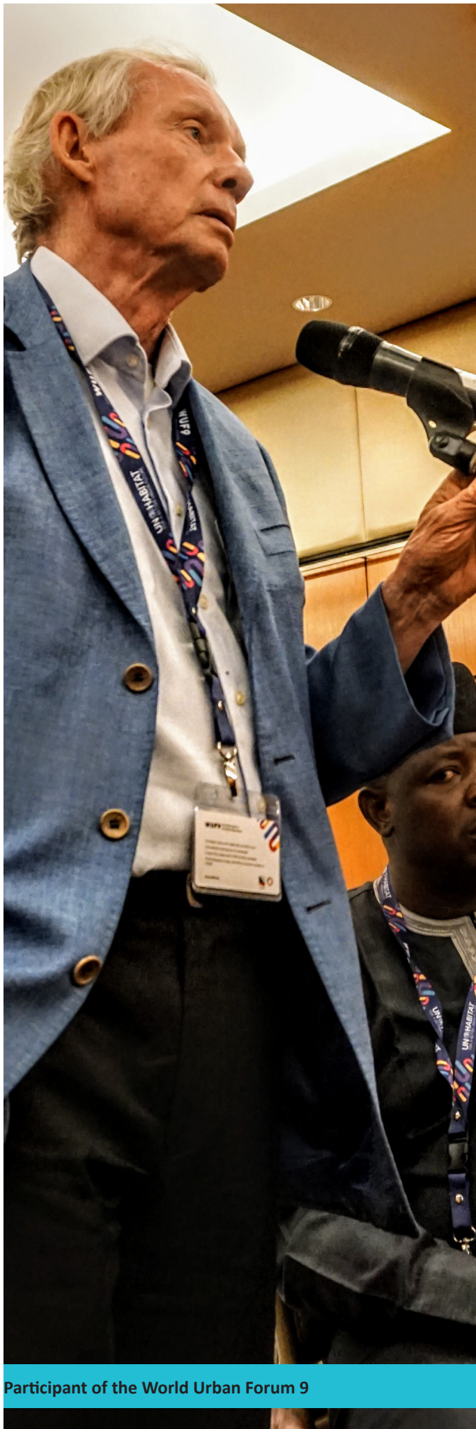
Participant of the World Urban Forum 9

ous: on-the-job training and continuous life-long learning are required in a world that is changing rapidly, which also begs for new ways of teaching and learning.