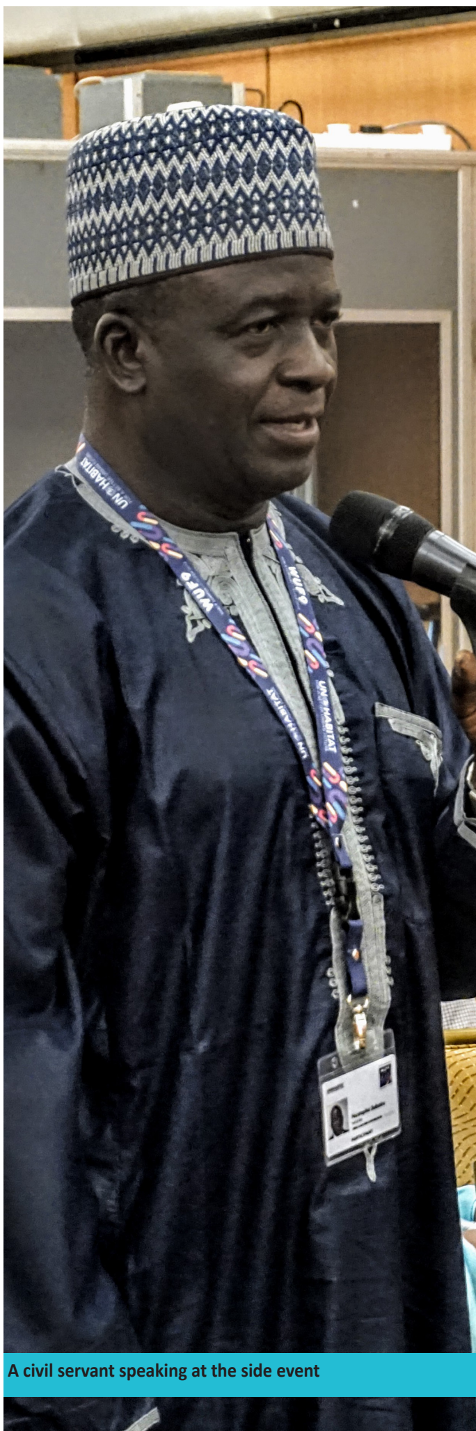
A civil servant speaking at the side event

But there are important challenges ahead.