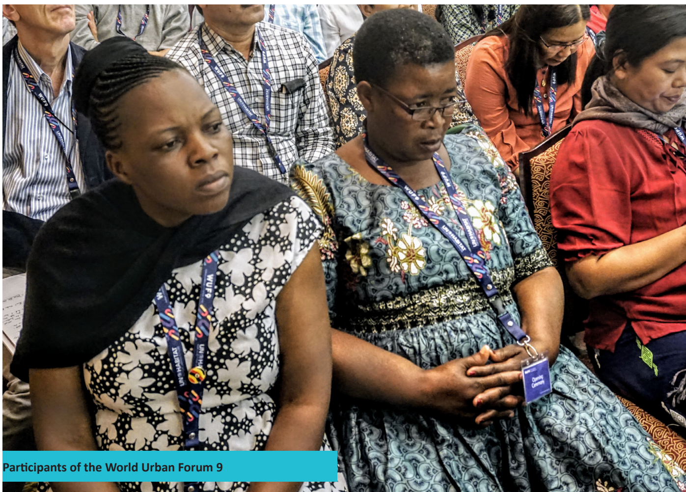
Participants of the World Urban Forum 9