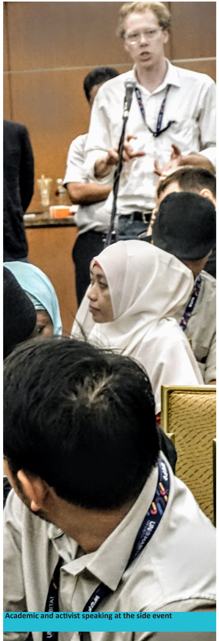
Academic and activist speaking at the side event

The conditions that led to this specific societal model now exist everywhere: all cities around the world must deal with water issues, scarcity of space, threats from a changing climate and from an uncertain economy. In summary, we must create the political and social conditions for sustainability transitions to happen. And we must incorporate this discussion into education, which leads us to the next point.